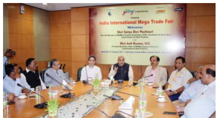
Honourable Minister of Khadi, Village Industries, Sericulture, Textile, Micro, Small & Medium Enterprises and Export Promotion of the Government of Uttar Pradesh, Shri Satyadev Pachauri, visited IITF and interacted with the organisers and participants

This was the first time that this show was organised in North India. It featured over 2 lakh products to choose from and was open to public. Discounts, deals and the Lucky Draw attracted many customers.