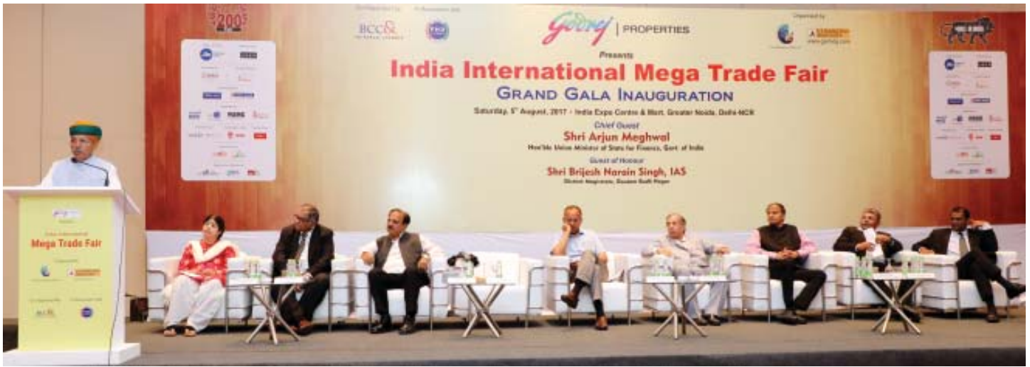
A glimpse of the GST Seminar held on 5th August 2017 with Hon'ble Union Minister of State for Finance & Corporate Affairs, Shri Arjun Ram Meghwal as the Chief Guest. This coincided with the inauguration of the India International Mega Trade Fair at India Expo Centre.