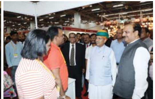
The Minister took a round of the fair and interacted with the participants