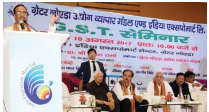
Hon'ble Deputy CM of Uttar Pradesh, Dr. Dinesh Sharma was the Chief Guest at the GST Seminar organised on 10th August 2017