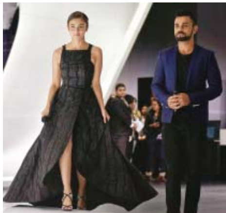
Celebs from the cricket world and tinsel town among guests at Auto Expo-The Motor Show, held at India Expo Centre from 3rd to 9th February 2016.